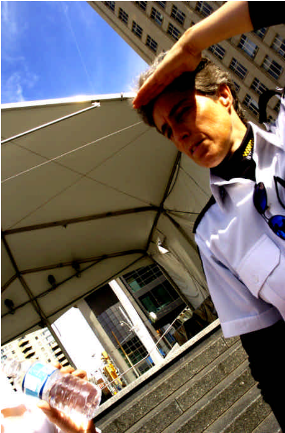
Figure 4: 8008 attempted to confiscate camera, after standing in front of it while it was running.

This suggests a need for a way to document what happens. In particular, if citizens are to be held accountable for their actions, they should have a right to document their actions, so that they can construct a case in their defence, especially in view of possibly dishonest or corrupt security guards. One can only imagine how Intelligarde 8008 might have acted had I deliberately photographed or videotaped her. (It's unfortunate I'd taken off my EyeTap so it wouldn't get wet when I ran through the fountains).