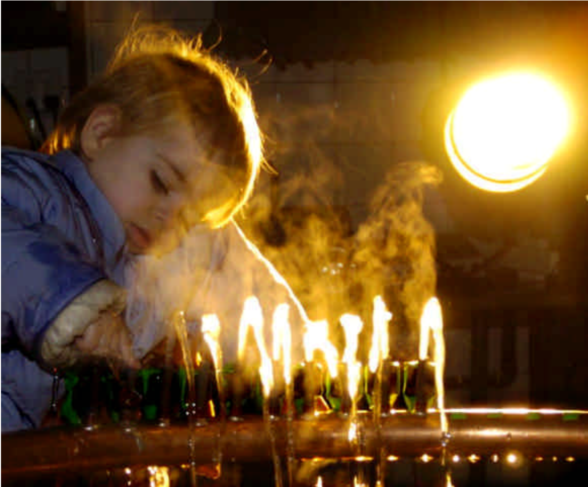
Figure 1: My 2 year old daughter warms up our holiday season by playing the popular (and easy-to-play) song, "Jingle Bells", at a FROLICious FUNtain performance. The FUNtain is played by blocking or partially blocking the various water jets. When I built this instrument, I included 61 jets (five octaves), but here only ten jets are active, configured for whole-notes only (no sharps or flats), in order to make it easier for a younger musician to play a simple melody.

play on words, meaning: (1) playful fun and frolic in the fountains; (2) to play a song, or to play music, as shown in the following figure: