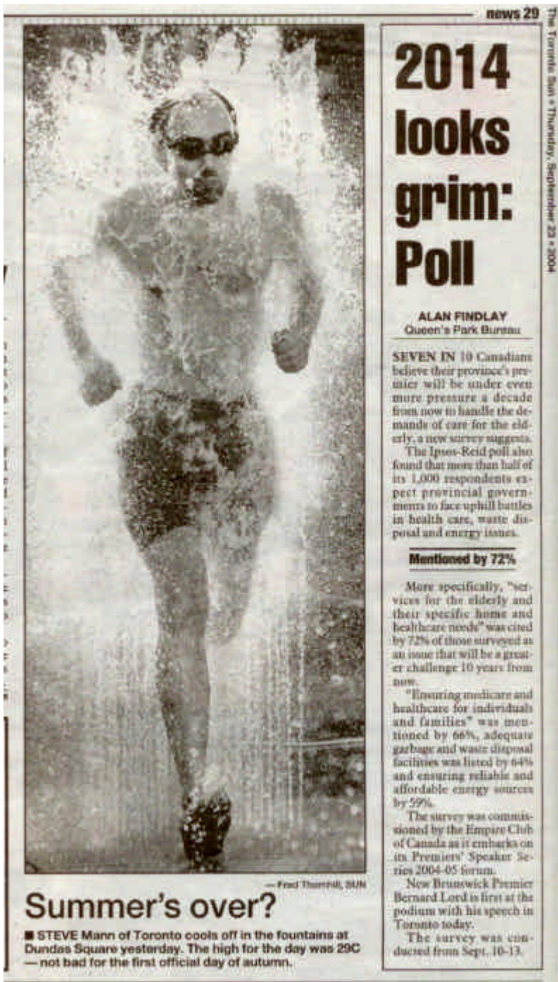
Figure 5: Summer's Over?

As it turned out, on a later visit, there was a big event there, and a Toronto Sun photographer was looking for a picture to capture the essence of the first day of autumn (above). I told him my story, and we said jokingly that we'd both meet in jail, if the laws of the land were writ large by 8008.